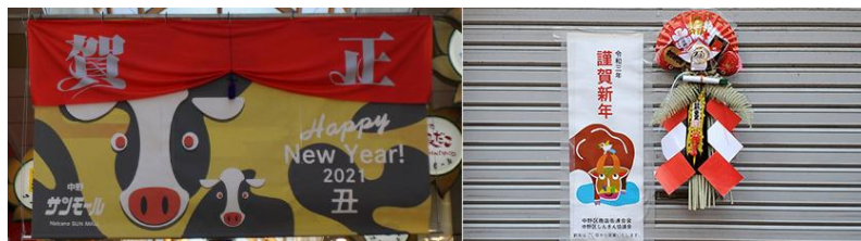
Ox-themed New Year's greetings for 2021 - a banner in a Tokyo shopping arcade (left); a poster on a shuttered storefront wishing customers a Happy New Year and informing them that the store will reopen on January 6, together with a traditional 'shimekazari' straw rope decoration (right)

Happy New Year from The Nippon Foundation. Although not officially beginning until the Lunar New Year next month, 2021 is the Year of the Ox under the Chinese zodiac cycle represented by 12 animals, which is also used in Japan. The ox is seen as having the positive characteristics of being hard-working, honest, and loyal. It is also associated with Sugawara no Michizane, a leading poet and scholar in ninth century Japan. He was born in 845, the Year of the Ox, and was known for being fond of using oxen for transport, including when he fell out of favor with the imperial court and was exiled from the capital. According to legend, the ox carrying his remains in his funeral procession stopped at a certain point and refused to move further. This was taken as a sign, and he was buried at that spot and a shrine built in his honor. After his death, a series of disasters struck the capital, and these were seen as his vengeance for having been exiled. To pacify his spirit, Michizane was deified as Tenjin, the god of scholarship, and today Tenman-gu shrines honoring Tenjin can be found across Japan.