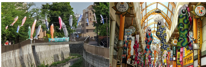
'Koinobori' streamers at an elementary school in 2021 (left); and a pre-pandemic display in a shopping arcade in 2019 (right)

Greetings from The Nippon Foundation. The week from April 29 to May 5 is known as Golden Week in Japan, with four national holidays falling during that period. This year, for the second year in a row, Tokyo and certain other areas were under a state of emergency because of an upward trend in coronavirus infections. Large department stores and entertainment facilities were closed, and sporting events were held without spectators. This year, the number of people going out or traveling was higher than last year, but still significantly lower than in normal years. The last of the Golden Week holidays is Children's Day on May 5, when families with young children wish for their children's happy and healthy growth. A popular Children's Day tradition is to fly carp streamers called koinobori , which appear to be swimming upstream – symbolizing courage and strength – as they fly in the wind. Elementary schools typically fly these streamers, and while many of these school activities were canceled last year, they resumed this year.