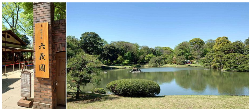
The entrance to Rikugien (left) and a view inside the park (right)

Rikugien, which can be translated as “six poems garden” or “garden of the six principles,” referencing traditional Chinese poetry, is one of Tokyo’s most beautiful landscape gardens. The gardens were built from 1695 to 1702 for the fifth Tokugawa shogun, and are now maintained by the Tokyo government and open to the public. The park is a short walk from Komagome Station in Bunkyo Ward, a residential area of northern Tokyo, making it easily accessible by public transportation. Scenic spots within the park include a large weeping sakura cherry tree, a teahouse built during the Meiji Period (1868-1912), a stone bridge, and pathways through wooded areas surrounding a large lake. A walk around the lake takes a little more than one hour, and provides constantly changing scenery that will make you forget that you are in the middle of one of the world’s largest metropolitan areas.