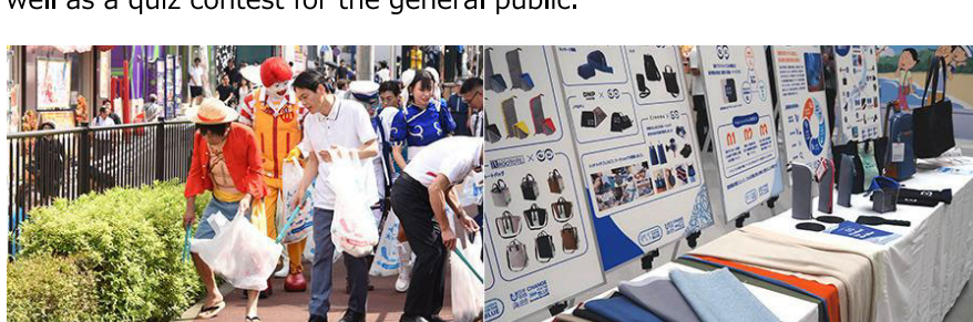
Picking up trash at the Autumn Cosplay de UMIGOMI Zero Week 2023 kickoff event in Yokohama (left); 'Upcycled' goods made from recycled fishing nets on display at the event for parents and children at Ito-Yokado Kiba (right)